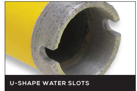
U-SHAPE WATER SLOTS