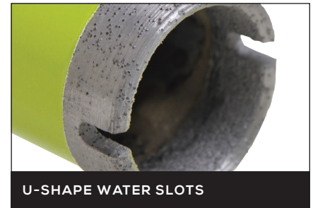
U-SHAPE WATER SLOTS