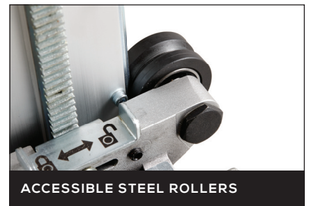
ACCESSIBLE STEEL ROLLERS