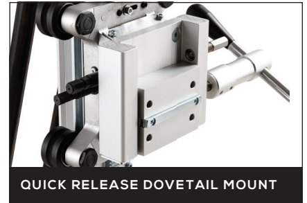
QUICK RELEASE DOVETAIL MOUNT