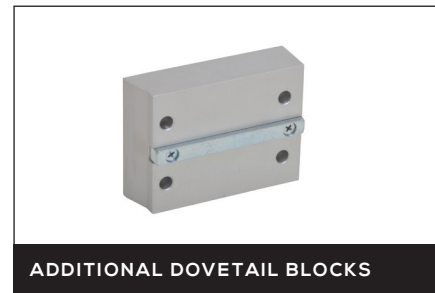
ADDITIONAL DOVETAIL BLOCKS