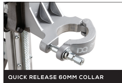
QUICK RELEASE 60MM COLLAR