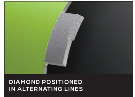
DIAMOND POSITIONED IN ALTERNATING LINES