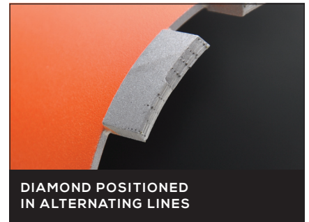
DIAMOND POSITIONED IN ALTERNATING LINES