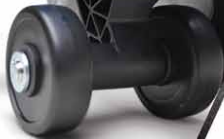
Integrated Vac Attachment Port