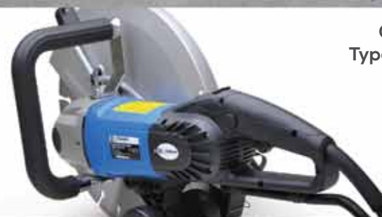
Chainsaw Type Handle